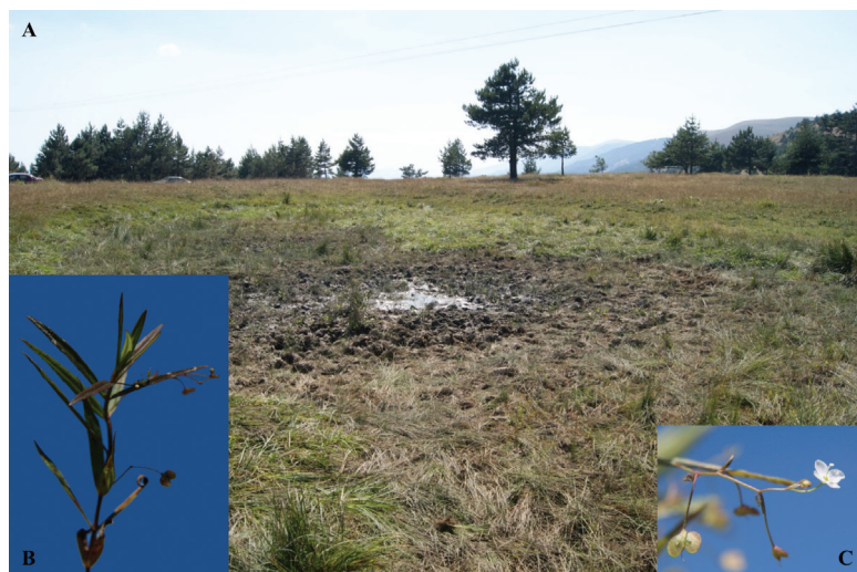
FIGURE 1. The photos were taken from Abant Region in August showing A- Natural habitat of V. scutellata , B- Aboveground parts of the plant and C- Flowers